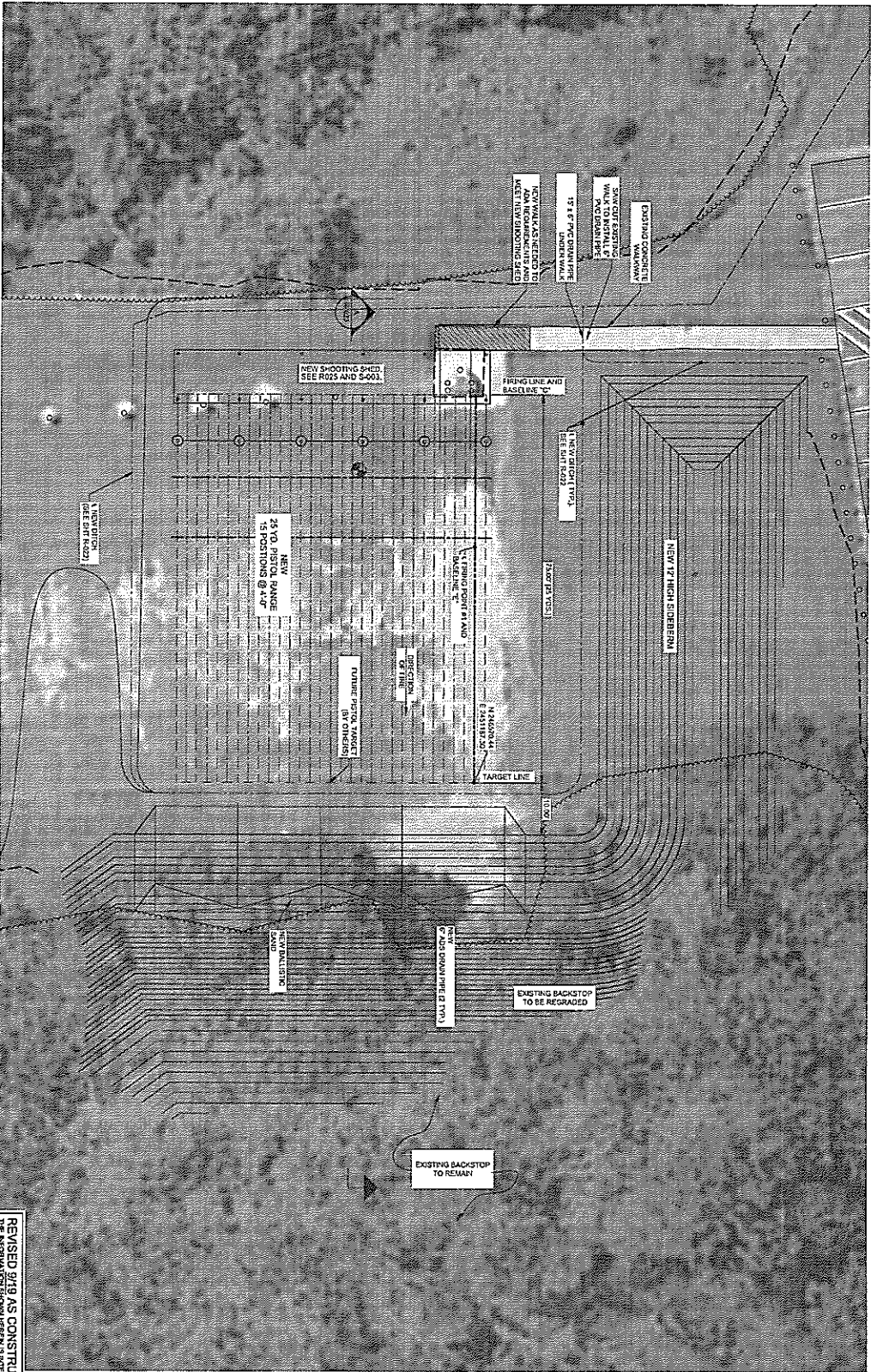
25 YD. PISTOL RANGE LOCATION SITE PLAN